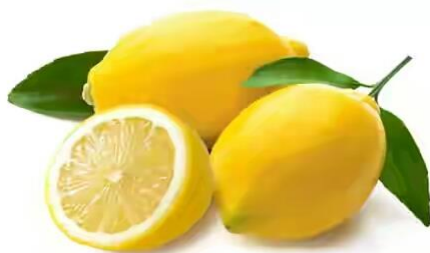
Fig: 9 Lemon