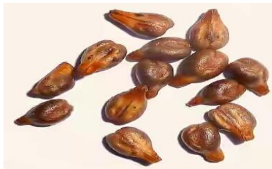
Fig:6 Grape seeds

5. Grape seeds B.S: Vitis vinifera Family: Vitaceae