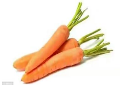
Fig: 8 Carrots