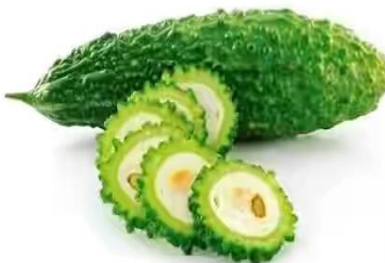
Fig: 7 Bitter guards

6. Bitter guard juice B.S: Momordica charantia Family: Cucurbitaceae