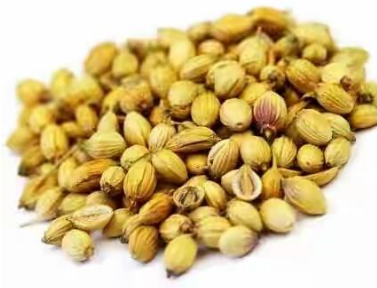
Fig:4 Coriander seeds